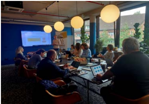
Photo: Transnational partner meeting of the HANNAH consortium in Hamburg, hosted by Centropa, in September.