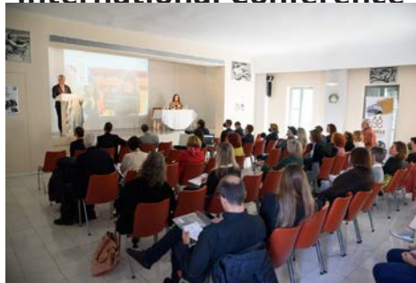
Photo: International Conference of HANNAH at the Ionic Center in Athens, Greece.