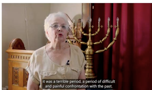
Photo: still from HANNAH documentary on Novi Sad

Interested in how historical, educational materials are created? Read HANNAH's new Educational Graphic Novel , which describes the steps that educators, researchers, and historians took to research, design, and develop a novel about the Novi Sad Raid. The Novel and a Manual for teachers, and educators with activities designed for students and learners are available online in German, Polish, Serbian, Greek, and English.