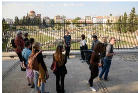
Photo: Guided city-tour at the historic centre of Athens