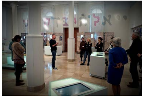
Photo: 4 th HANNAH training seminar in Płock, hosted by Muzeum Żydów Mazowieckich

Four training seminars in each country were organized by the project partners to enhance knowledge on local Jewish history and the Shoah, and increase awareness on antisemitism, develop innovative tools against antisemitism, and contribute to combating it. More information about the implemented HANNAH seminars can be found here .